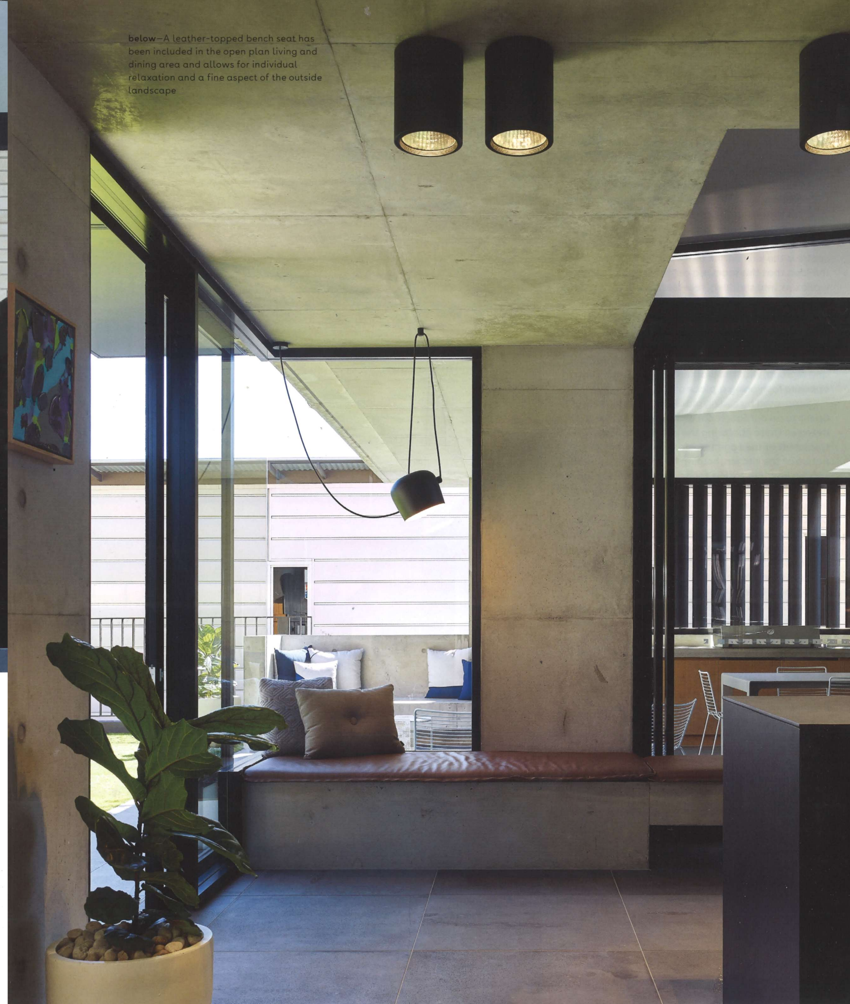
below —A leather-topped bench seat has been included in the open plan living and dining area and allows for individual relaxation and a fine aspect of the outside landscape